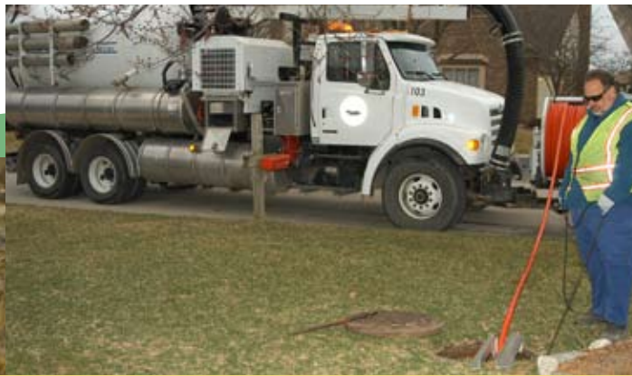
FOG build-up in sewer pipes (shown below) is costly to clean requiring local public works staff to go to the site and remove the blockage (shown above).